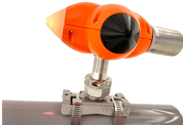
ClampOn BIRD sensor