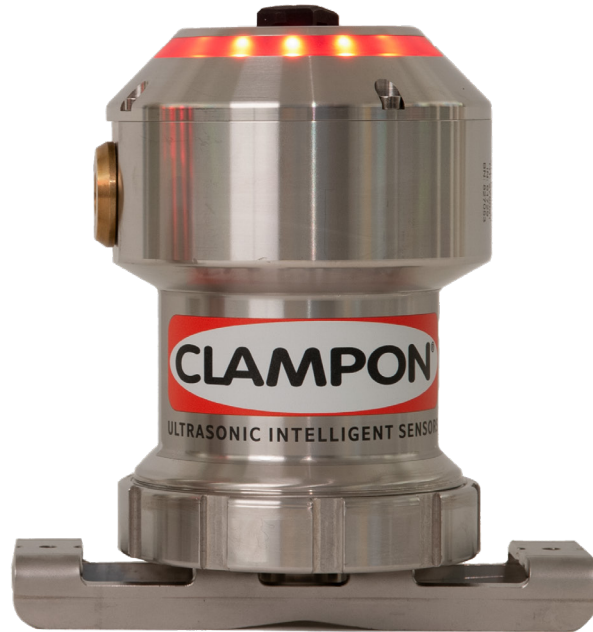
ClampOn DSP PIG Detector, Ex i and Ex d version with local indicator lamp