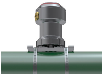
Illustrations of sensor installed on pipe

in flow velocity that can occur over time will have minimal effect on the measured results. If only the local indicator lamp is used, the instrument requires just a 1-pair cable for power. If a signal output is also required, a minimum of a 2-pair cable is required.