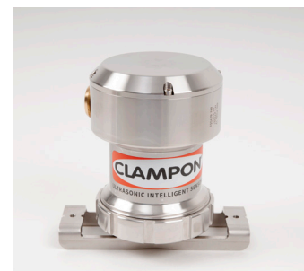
Ex d detector

RAW-signal output for further processing, and can be sent over RS 485 or 4-20 mA interfaces. By using either a dedicated computer running ClampOn software or sending the output to the MCS, the user can see a graphical representation of the signal received from the PIG Detector.