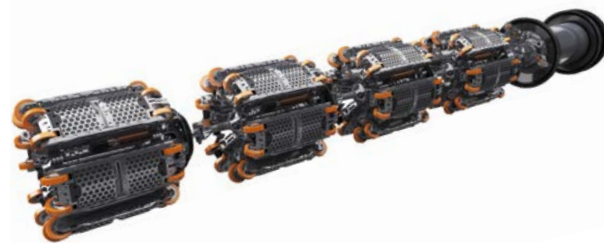
PROTON - Phased Array Inline Inspection Tool