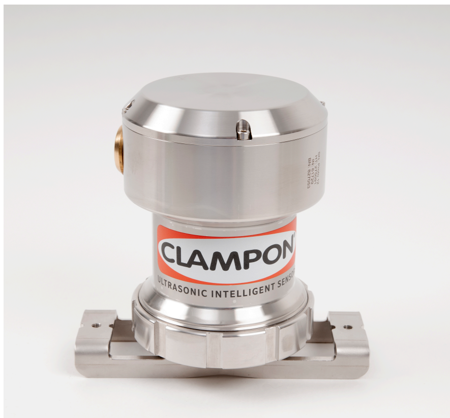
ClampOn DSP Leak Monitor Ex d version