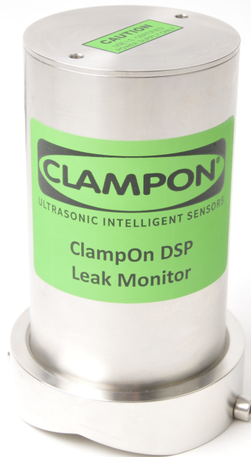
ClampOn DSP Leak Monitor Ex ia version.