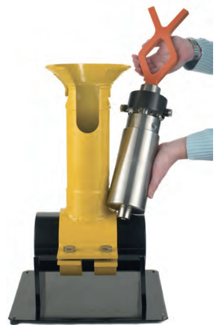
Subsea version of the ClampOn DSP Leak Monitor.

The basic theory is that a leak creates a very high-frequency noise that can be monitored by an ultrasonic sensor. In a «non-leak» situation the ultrasonic pattern will be stable, but when a leak occurs the signature will change drastically. The ClampOn DSP Leak Monitor is based on the ClampOn Ultrasonic Intelligent Sensor technology platform. The instrument's ability to monitor signal at multiple frequency, combined with extreme sensitivity enables it to distin-