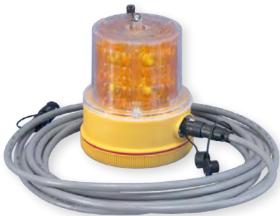
OPTIONAL REMOTE FLASHER