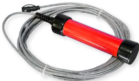
OPTIONAL REMOTE ANTENNA