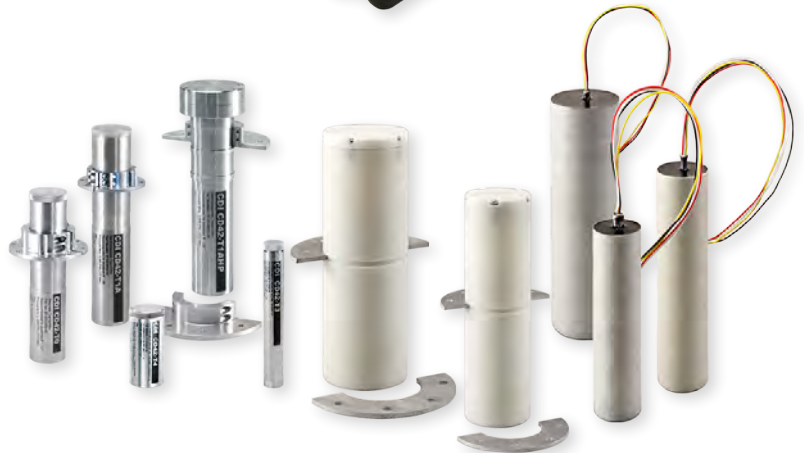
SUPPORTS CDI X-SERIES, CD42 "LEGACY," AND MANY OTHER PIGGING TRANSMITTERS