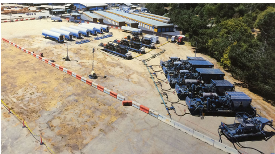
Compressors transferring vaporized LNG to supply pipeline