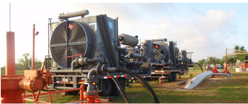
Compressors evacuating pipeline