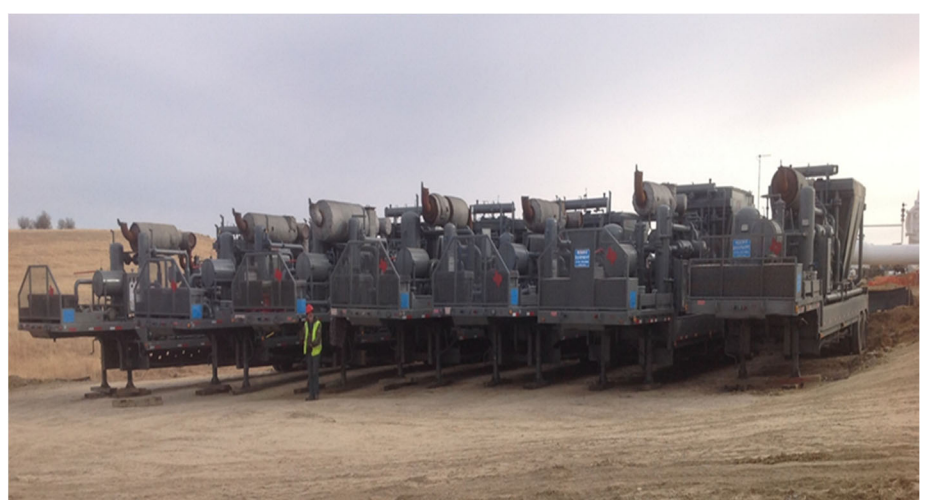
7 units providing temporary compression during station outage