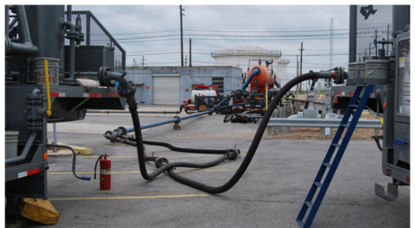
Compressors pulling gas off a separator during pigging operations